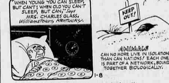
WHEN YOUNG YOU CAN SLEEP, BUT CAN'T; WHEN OLD YOU CAN'T SLEEP, BUT CAN! WIFE CHARLES GLASS, Williamsburg, Kentucky.