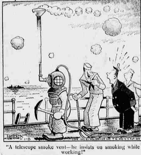
"A telescope smoke vent—he insists on smoking while working!"