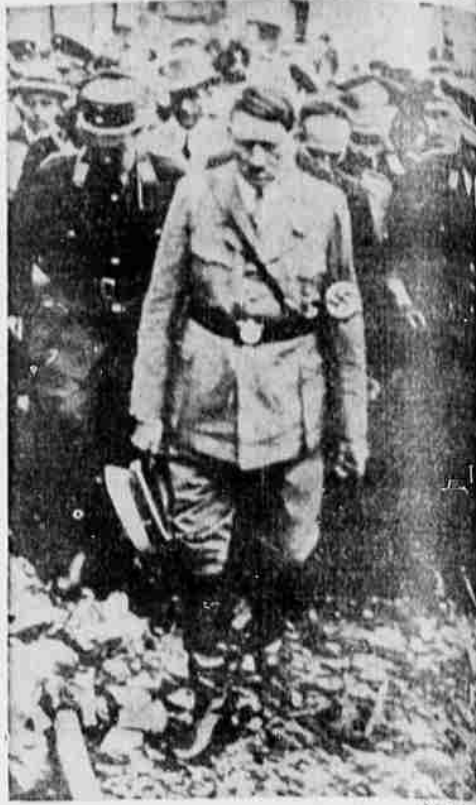
A sad-faced Adolf Hitler, hat in hand, surveys ravages of war as he identifies Nazi leaders in an undesignated German city. He was captured by U. S. Signal Corps on western front but taken is unknown.