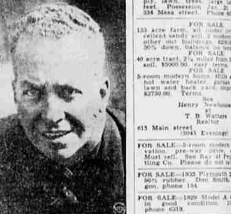
Cornelius Vanderbilt, Jr., above, 48, socialist author and lecturer, was hospitalized at Chicago when stricken with a heart attack while aboard a train. He was en route from California to New York.