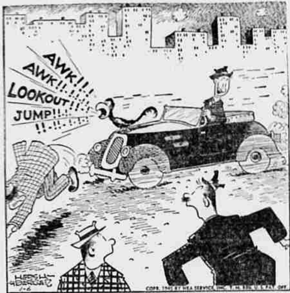
"I'm using her instead of a horn, to save my battery!"