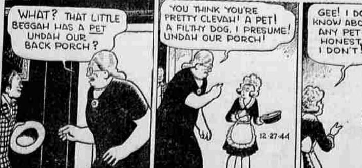
What? That Little Beggar Has a Pet

1 animal 20 Mother 21 Employ 22 Observe 23 Tellurium 24 Moist 25 Sheltered side 31 Winglike part 32 Paving substance 36 Inquire 37 Remove 38 Tell 39 By