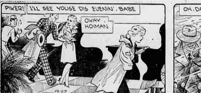
Freckles and His Friends