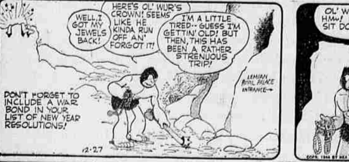
Little Orphan Annie

HORIZONTAL 60 Shade tree 61 She received the Bronze Star for meritorious service 62 Organ of smell