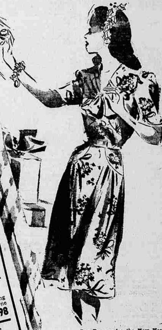
Gay Dresses for the New Year Rayon Jersey Prints

As a special courtesy to our employes and to enable them to more fully enjoy the holiday season, our store will close at 6 o'clock Saturday evening, Dec. 23rd.