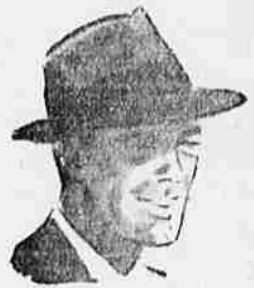
Choice of Brim Widths, Styles!