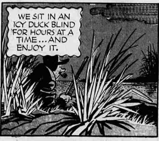
WE SIT IN AN ICY DUCK BLIND FOR HOURS AT A TIME... AND ENJOY IT.