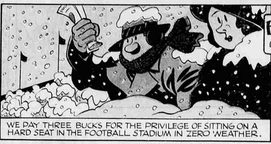
WE PAY THREE BUCKS FOR THE PRIVILEGE OF SITTING ON A HARD SEAT IN THE FOOTBALL STADIUM IN ZERO WEATHER.