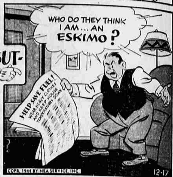
WHO DO THEY THINK I AM... AN ESKIMO?