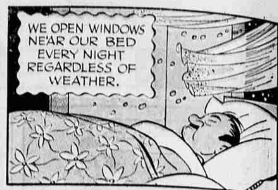
WE OPEN WINDOWS NEAR OUR BED EVERY NIGHT REGARDLESS OF WEATHER.