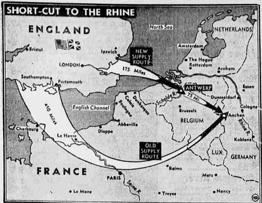
Contrast in size of arrows on the map above graphically illustrates the importance of the great Belgian port of Antwerp, with its 30 miles of docks, to the task of supplying Allied armies in Europe. Supply-line picture is further brightened by steady improvement of rail links between Cherbourg, Le Havre, Marseille and other French ports with U. S. and British battlefronts.

Mr. Machinist, put your calipers on THIS job If it doesn't measure up to something better than most, we mean this Machinist's shop with Southern Pacific... your shops or roundhouses... you work on locomotives with good equipment... with men who can fit 'em tight and close. This is railroading on the ground floor... rolling for the enormous war loads which S.P. is carrying for a long time. Good wages—regular R.R. standard. Good work appreciation. Good working conditions. Good pass privileges. Fine pension plan. Medical and hospital services. A good job for a good Machinist—no railroad experience required. Many other good things.