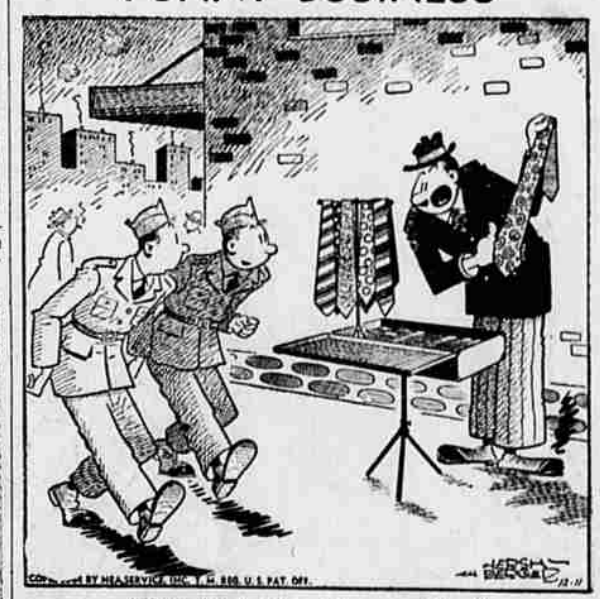
"How about some postwar neckties?"