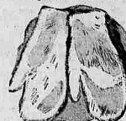
Fur Mittens 1.98

Full fashioned fit hose... semi-sheer for excellent wear. In beige-tone and taupe-tone.