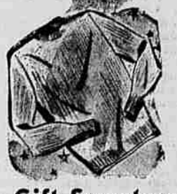
Gift Sweaters 4.98

Soft zephyr wool yarns in soft or bright color pullovers. Women's sizes, 34-40. Others, 2.98 to 5.98.