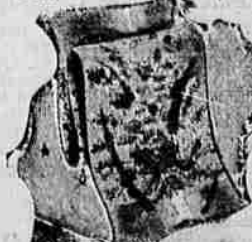
Pretty Scarfs 98c

Soft as down, this warm bunny fur—and warm as the sun! Lined with soft cotton fleece. Plus 20% Fed. Excise Tax.