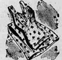
Rayon Gowns 3.98

Soft zephyr wool yarns in soft or bright color pullovers. Women's sizes, 34-40. Others, 2.98 to 5.98.