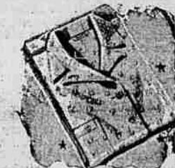
Smart Pajamas 4.98

Rayon crepes and satin prints in a fine gift selection, 34-40. Others, 2.98 to 5.98.