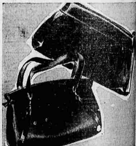
WARDS NEW HANDBAGS ARE REALLY EXCITING 1.98

We even have the new sleeveless ones, too, at this thrifty price. In exquisite colors like turquoise, maize, lime, fuchsia. 34 to 40. See them at Wards!