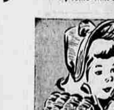
HAT AND MUFF SETS FOR HER CHRISTMAS 3.98

Fluffy blends of 5% new wool, 95% cotton, woven for maximum warmth. 3 1/2 pounds, 72"x84".