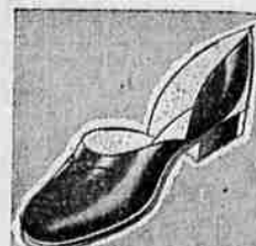
MEN'S BROWN KID SLIPPER 2.19

Get Dad a warm wool plaid, or a smart rayon print—or buy him one of each! Solids, too!