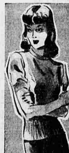
HAD YOU THOUGHT OF A PURE WOOL SWEATER? 2.98

So pretty! So serviceable! In good sturdy rayon satin that does up with a will! Sleek-fitting and well made! Double-stitched seams. 32-40.