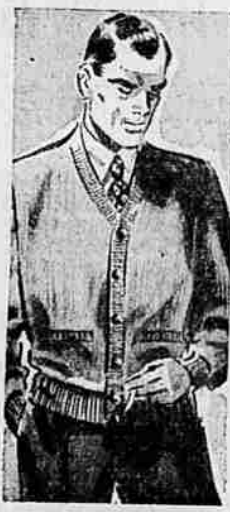
MEN PREFER SMART COAT STYLE SWEATERS 3.98

He'll thank you every time he wears this robe—every time he enjoys the luxurious feel of its rich rayon fabric... the superlative comfort of its full generous cut... the expert craftsmanship revealed in every minute detail of its construction. It's tailored with a roomy patch pocket, and a wide non-slip sash edge.