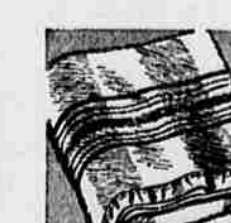
WARM DOUBLE BLANKET PART WOOL 3.34

Yes! They're 1/4 new wool, the balance cotton! Rayon satin bound. 3 1/4 pounds, 72"x84".