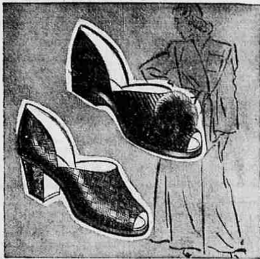
D'ORSAY SLIPPERS IN TWO SMART STYLES 2.49

Ask any man what he wants for Christmas and nine times out of ten he'll say "a white shirt"! He knows that a white is the most versatile of shirts—in perfect taste for every occasion, every day of the year! Here's another tip: he prefers Wards shirts—for their smoothly woven, durable fabrics... their superb tailoring... perfect fit (they're Sanforized!)