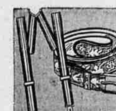
BELTS AND SUSPENDERS FOR BOYS 49c Each

A classic opera that's ideal for lounging! Has a sturdy hard leather sole. Not rationed.