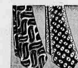
SMART TIES ARE ALWAYS WELCOME 1.00

They'll like these handsome all-leather belts... these colorful metal clip-on suspenders!