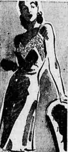
GIFT SLIPS—LAVISHLY TRIMMED WITH LACE 1.98

The secret wish of every little girl is to be as glamorous as big sister! Keep her dainty with these open toe slippers in lustrous satin with a bunny trim. Red, blue. 12-3.