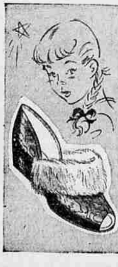
CHILDREN'S D'ORSAYS—HIGHLY STYLED 1.98

Say "Merry Christmas" with this warm 100% wool sweater! It's as smooth-fitting and comfortable as it is sturdy. Securely sewn leather buttons.