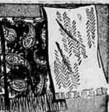
HE'LL BE GRATEFUL FOR A MUFFLER 2.98

Drop into our handbag department, look over our excellent assortment and see if you don't agree with us! You can choose wonderfully roomy styles that hold everything from small change to giant sized compacts! For dressy and sports wear! Rich-looking simulated leathers, including shiny black patent! Pouches, envelopes, top handles, some with zippers! Black, brown.