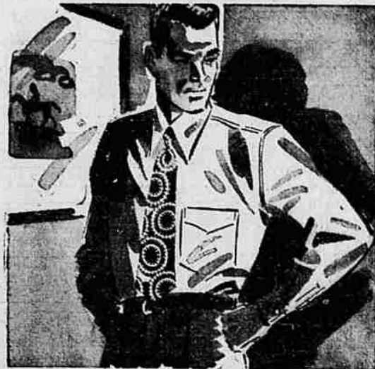
PLEASE HIM WITH A HANDSOME WHITE SHIRT 1.89

See These And Hundreds of Others At MONTGOMERY WARD