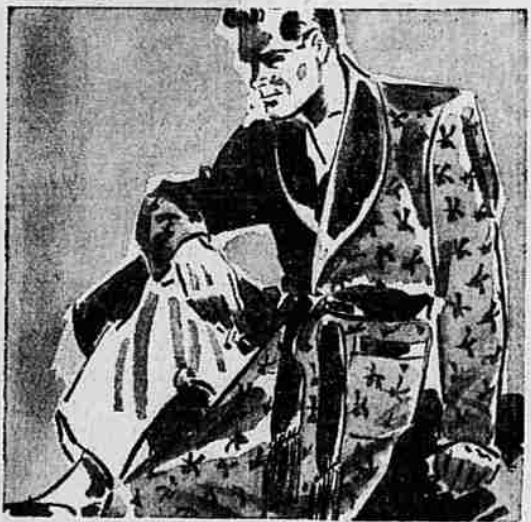
THIS YEAR, GIVE HIM A HANDSOME DRESS ROBE 9.98

Mother, sister, aunt—any woman on your list will bless you for a chenille robe. They're so warm, so easy to care for (just launder and shake out—no ironing). And Wards chenille robes are particularly nice at the price. Thick, thick rows of tufting. A generous wrap. In blue, dusty rose, cherry, 14-20. Other Chenille Robes for Christmas Giving... $7.98