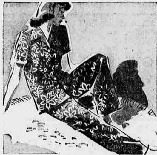
GIVE HER GAY PAJAMAS IN FLOWER PRINTS 3.98

Of course she needs slippers for Christmas! Especially these dainty feminine ones from Wards! Here are two of the many exciting styles she can choose from! They're open toed and have platform soles! Either rich corduroy with fluffy pompon... or lustrous embroidered satin with covered Cuban heel. Both come in attractive blue. Sizes 4 to 8. Unrationed.