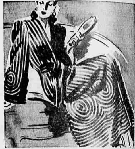
ANY WOMAN WOULD LOVE A FINE CHENILLE ROBE 6.98

She'll like the smooth, rich feel of their rayon crepe. She'll appreciate the sleek way they fit, and she'll notice how nicely they're finished! Best of all, she'll like their handsome flower pattern—so smart and so new-looking! Come in! Look them over thoroughly before you buy! You'll agree with us that they'll make marvelously welcome gifts! Sizes 34 to 40.