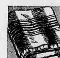
COZY DOUBLE BLANKETS 25% WOOL 4.98

No man ever owns too many ties! See Wards handsome collection of fabrics, patterns and colors!