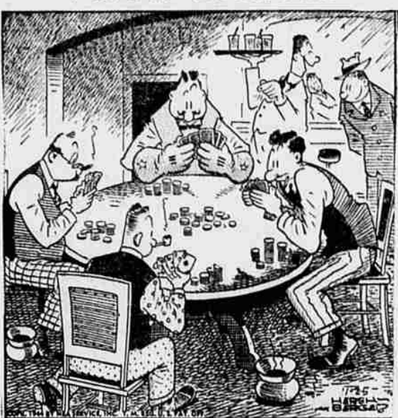
"They always make him wear them when they play poker —he's a magician!"