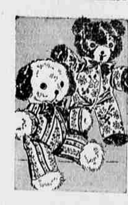
GOOD QUALITY STUFFED ANIMALS

Designed to help one-to-fouryear-olds try out new musclas, teach hands and eyes to work together! Set includes Hammerboard, Pyramid, Ring and Peg Pull, another Pull Carl All wood!