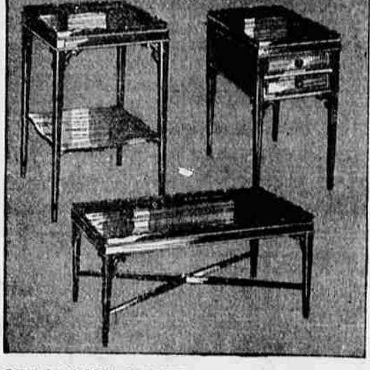
GRACEFULLY STYLED MAHOGANY TABLES

Add beauty to your home with these exceptionally graceful tables, All have the details that go to make up fine furniture . . . gracefully turned legs, sturdy construction and gleaming Mahagany veneers on solid Mahogany, Included are: Cocktail Tables, Commodes and Lamp Tables. See these beauties at Wards!