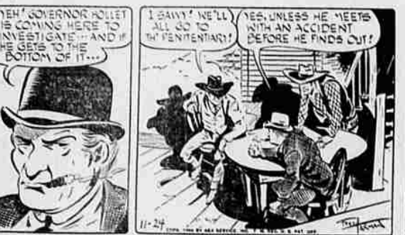
By Leslie Turner