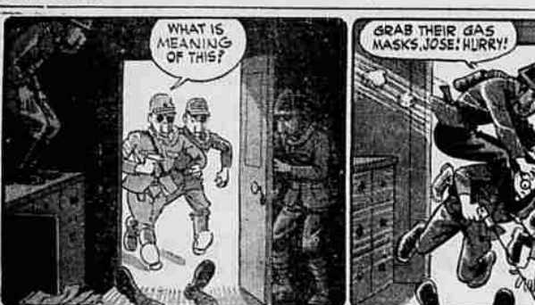
Freckles and His Friends