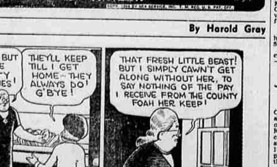
By Harold Gray

Exchange rates for two hours were around 400,000 shares. United Corp. preferred jumped a point or so to a top for the year, opening on a block of 10,000 shares.