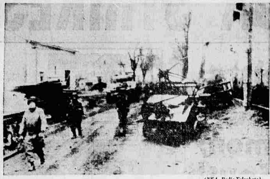
Units of the 96th Division, U. S. Third Army, move past row upon row of destroyed German equipment as they fought street by street through Metz—the first time in the history of modern warfare that this fortress city had been pierced by frontal assault.