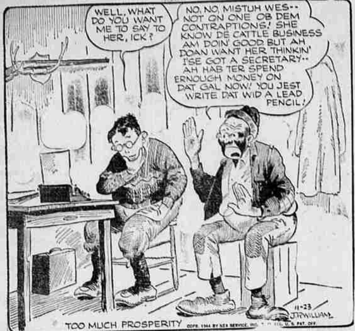
TOO MUCH PROSPERITY