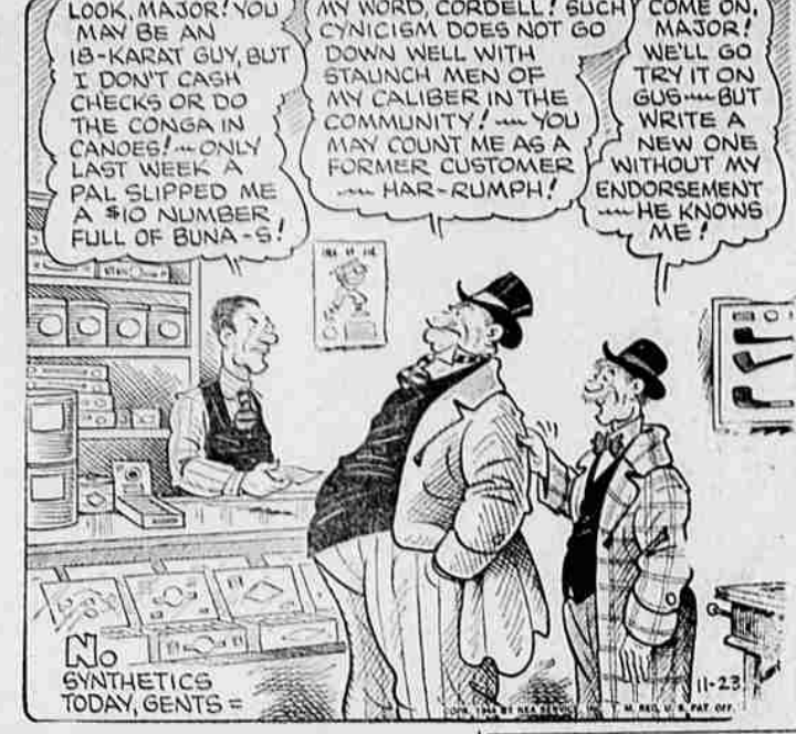
NO SYNTHETICS TODAY, GENTS