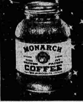
500 other MONARCH FOODS—all just as Good!

It's so easy to get prompt, effective relief from distress of head colds with Vicks Vapo-Nol. Works right where trouble is to reduce congestion—soothe irritation—make breathing easier. Also helps prevent many colds from developing if used in time. Try it! Follow directions in folder.