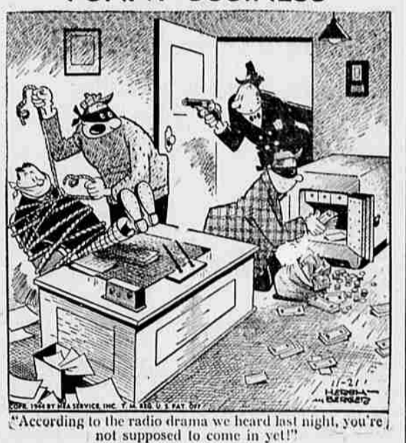
"According to the radio drama we heard last night, you're not supposed to come in yet!"