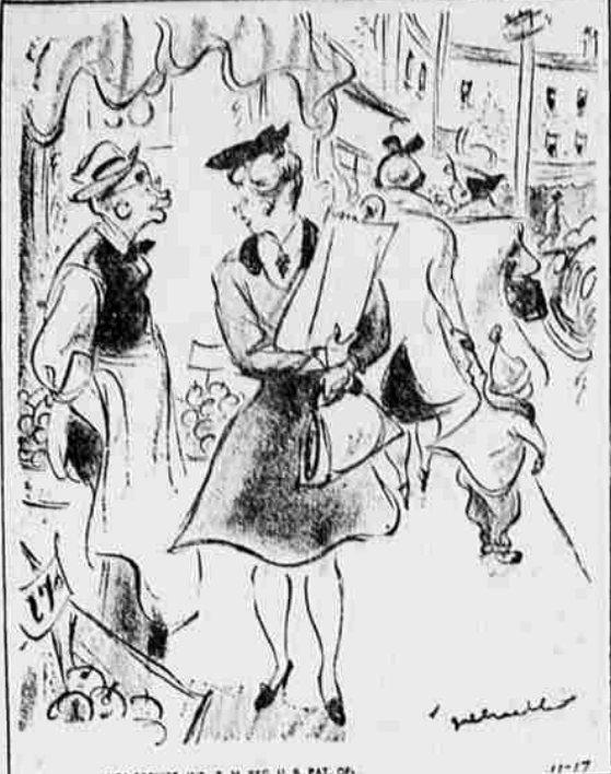
"Thank you for the compliment! I feel wonderful, too, since our car was junked and I've been taking that long walk to the beauty shop twice a week!"