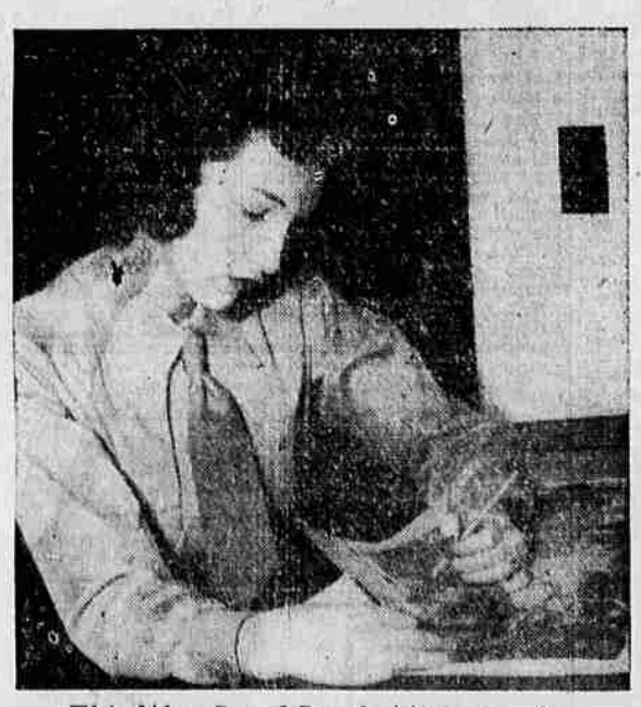
This Wac Proof Reads Maps for the Ground Forces