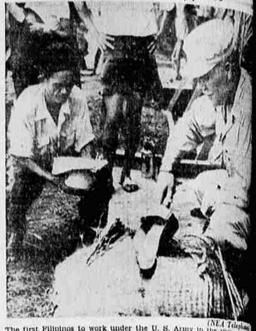
The first Filipinos to work under the U. S. Army in the Philippines...