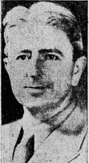
Gen. Joseph W. Stilwell (center), relieved as U. S. commander in Far East in sensational move which assertedly stemmed from direct demand by Generalissimo Chiang Kai-Shek. Lt. Gen. Daniel I. Sultan (left) will command American forces in Burma-India theater. Maj. Gen. A. C. Wedemeyer (right) will command the China theater.