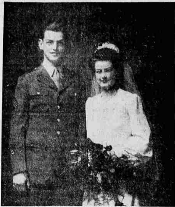
MARRIED IN ENGLAND

Expert Linoleum Laying . . . . Guaranteed Work, of Course Klamath Furniture Co. ARMSTRONG — LINOLEUM — NAIRN 221 Main St. Phone 5353