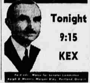
Wayne Morse for Senator-Lexington, Va.