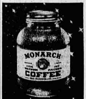
500 other MONARCH FOODS—all just as Good!

SPECIALIST'S CHOICE! Use formula sent us by Thornton & Minor Clinic, Bellevue plus pain, itching, soreness QUIT! Then, treat with shrink swelling, reduce. Get $1.00 tube Thornton & Minor's Rectal Ointment. Or get Thornton & Minor's Rectal Suppositories, only a few cents more. Try DOCTORS' way TODAY. At all good drug stores everywhere.