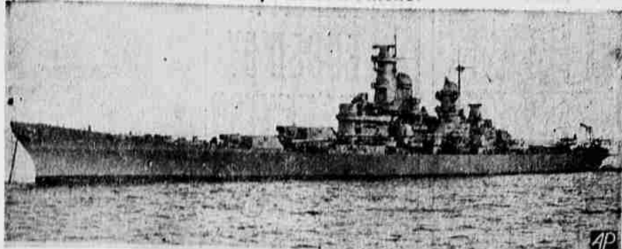
Armed with the most modern array of guns, the battleship USS Iowa lies at anchor and motionless awaiting the call to action. The "Big I" is an arch-type of the U. S. navy's newest class of battleships.