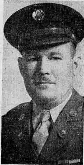
(Veteran World War II)