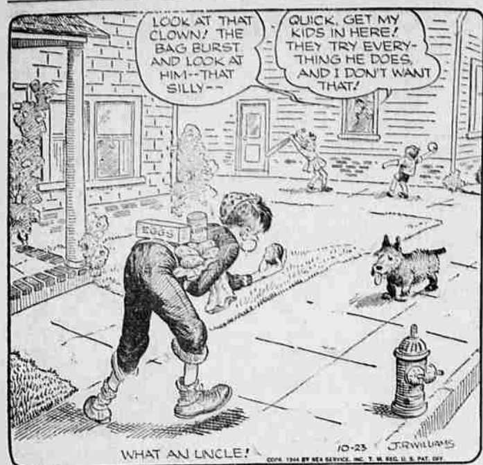
WHAT AN UNCLE!