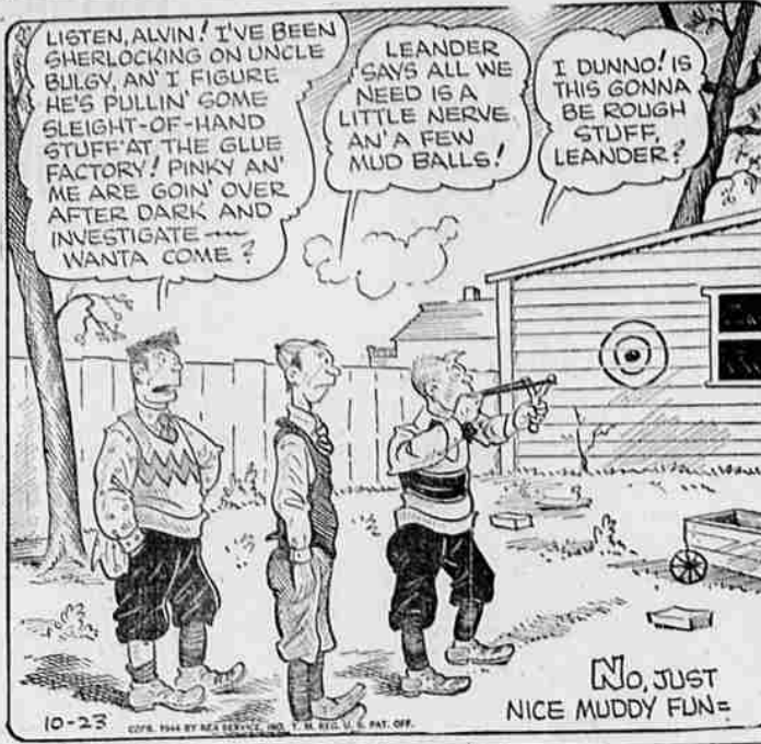
No, just nice muddy fun.