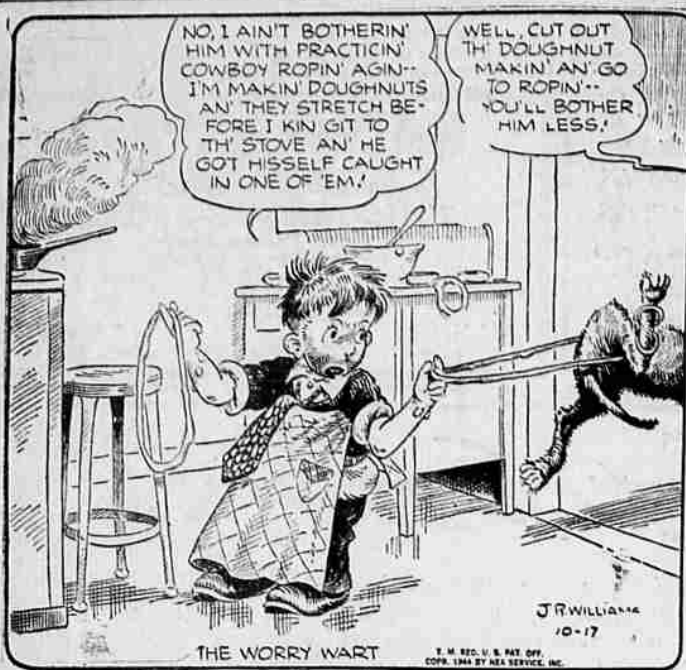
THE WORRY WART