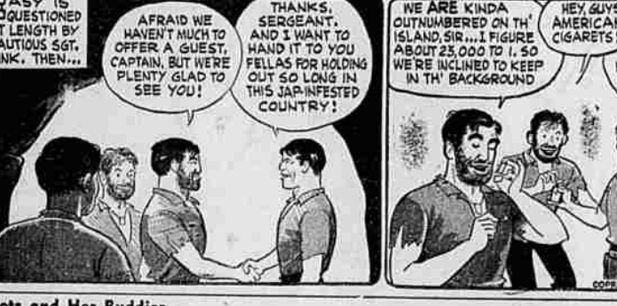
Boots and Her Buddies