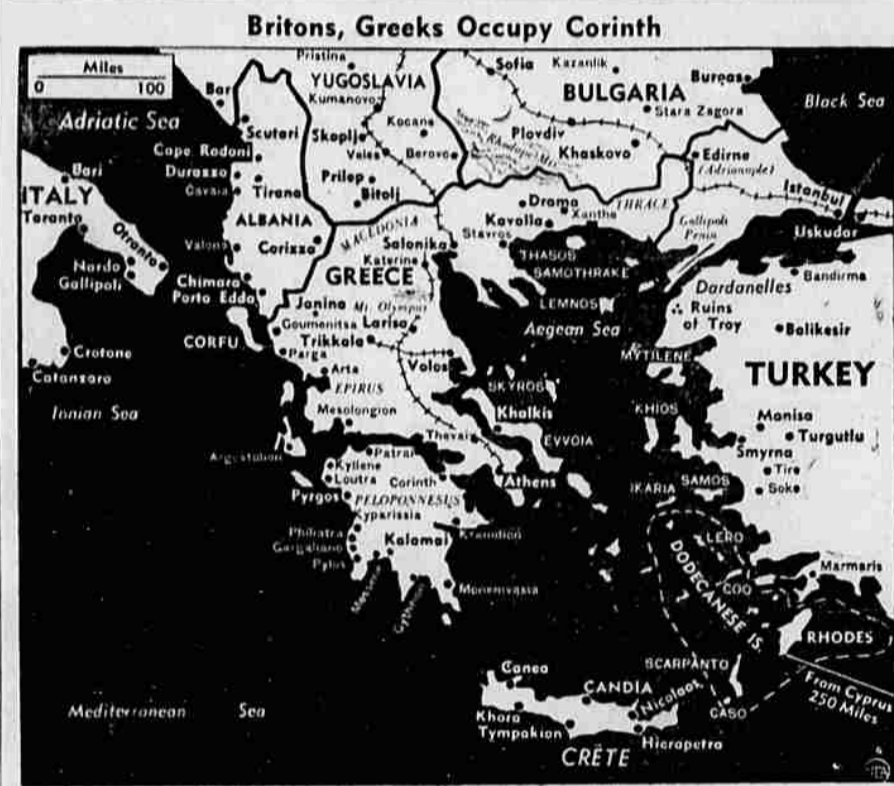
Allied forces today occupied Corinth, on the south end of the Isthmus linking Peloponnesus with the Greek mainland. Adriatic units were reported attacking Sarande, supply base for the Nazi garrison on Corfu. Dispatches indicate that British and Greek troops are continuing their drive from Corinth, and it is believed the drive may lead to Athens.