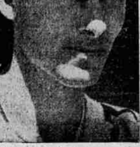
Harry Brecheen, above, put the Cards back in the running in the World Series by forcing the Browns to take a 5-1 loss in the fourth series tilt.