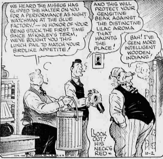
LOOK OUT! HIS NECK'S RED