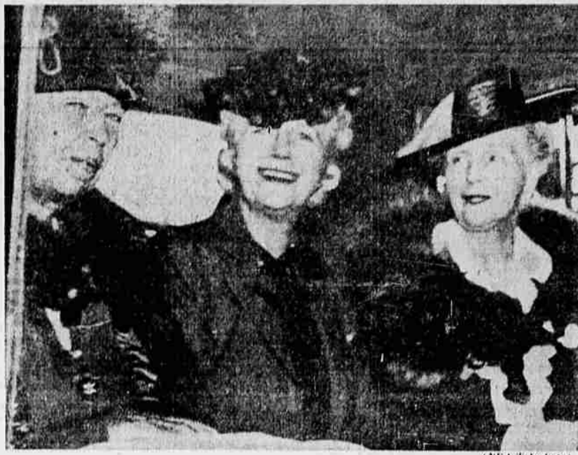
The First Ladies of America, Britain and Canada meet in Quebec as their famous husbands opened a victory conference to map final plans for defeat of Japan and Germany. Left to right: Mrs. Roosevelt, Mrs. Churchill and Princess Alice, wife of Canada's governor-general, the Earl of Athlone.