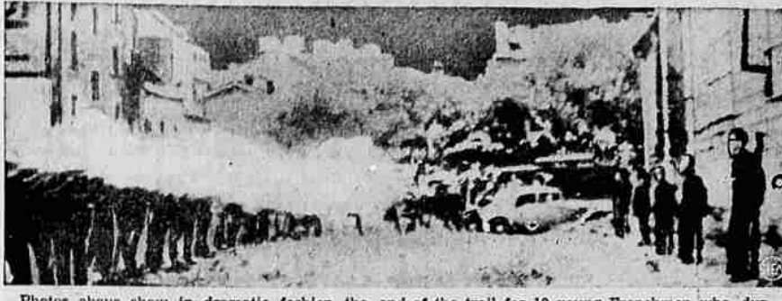
Photos above show in dramatic fashion the end of the trail for 10 young Frenchmen who, during the four long years of Nazi domination of their country, chose to side with the enemy. Two were sentenced to five years in prison, two to hard labor for life. The remaining six were condemned to death and, as seen in the photo above, were summarily executed by a French Force of the Interior firing squad.