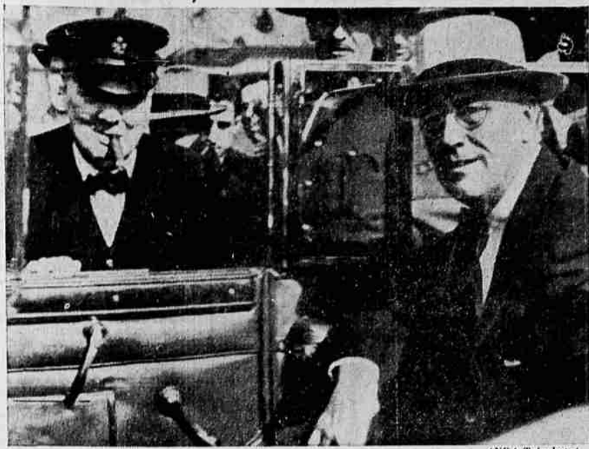
Smiling broadly, President Roosevelt and Prime Minister Winston Churchill meet again in Quebec, both pleased over progress of the war and ready to start drafting new plans for final and complete victory over Germany and Japan. "Victory is everywhere," Churchill said to the President as they met for their 10th wartime conference.

gia, democratic party whip in the U. S. house, said the results in Maine "don't prove a thing" and that "we believe that with a little work" the democrats can carry the traditionally republican state in November.