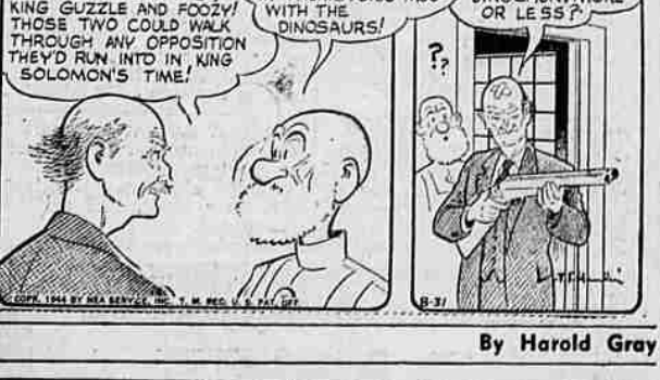
By Harold Gray