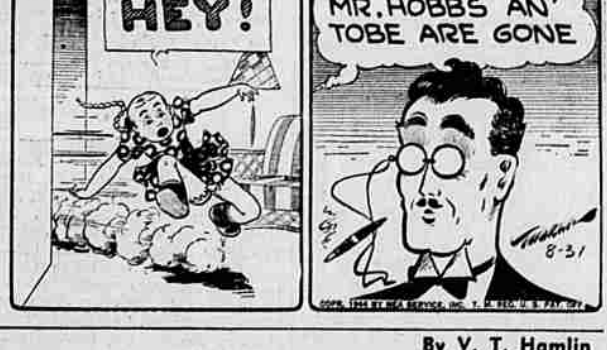
By V. T. Hamlin