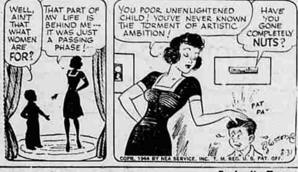
By Leslie Turner