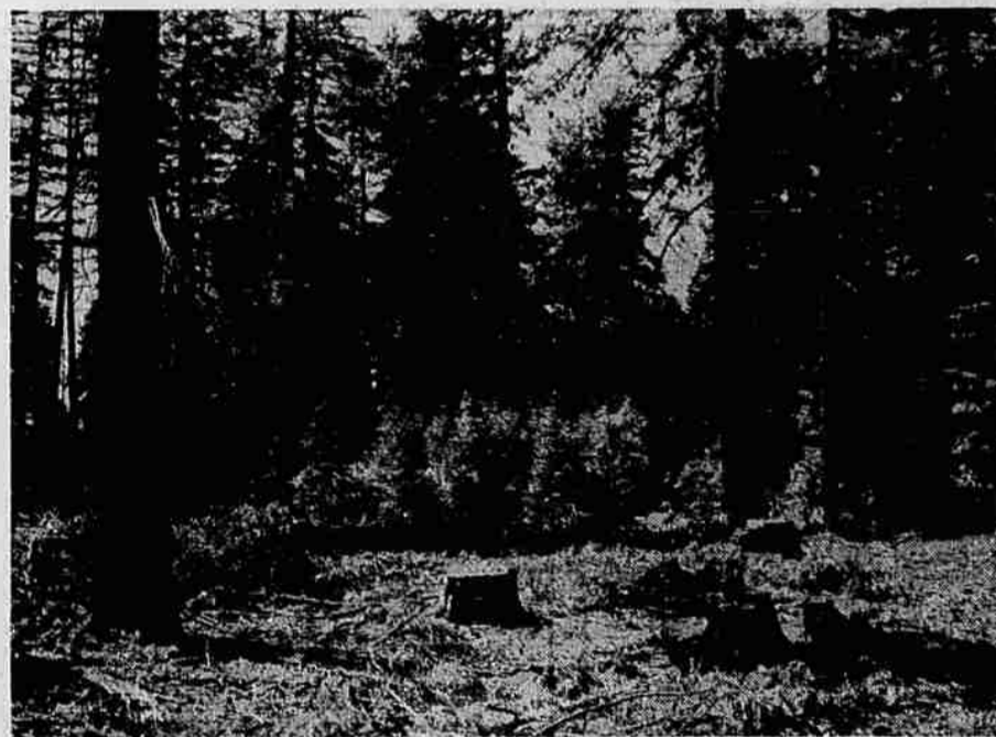
Typical Scene After Timber Harvest -- As Klamath Is Kept Green

We had a fine record of forest fire prevention last year. This record is a credit to Klamath Falls. Let's do even better in 1944. Klamath County is an important sector of a green, timbered Oregon. By Keeping Klamath Green, we are doing our part in the bigger job--to KEEP OREGON GREEN .