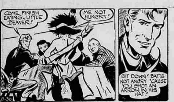
Freckles and His Friends

28 Miscellaneous For Rent FOR SALE —320 acres, fine building site, electric power, reasonably priced. Located on Maddock's Creek, near Klamath Falls, Oregon. FOR SALE —Modern 2-bedroom house, 2 1/2/10 acres. 4317 Blibee St. FOR SALE —2-bedroom house with new shingle roof. See Cutting, 21 So. 233-1f. FOR SALE —4-room house with new kitchen. 311 Division. FOR SALE —2-bedroom house with electric pump. 4000 So. 11th in Altira. See F. Call after 7 p. m. FOR SALE —218 new irrigated ranch in Shasta Valley, Calif. 3401, no realtor.