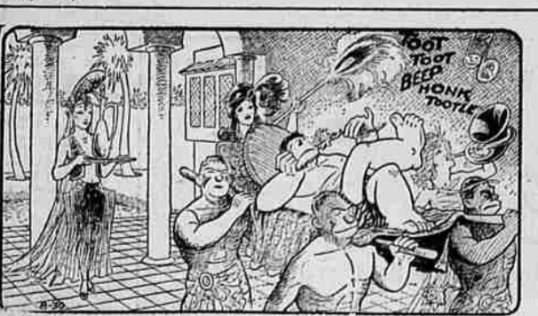
Little Orphan Annie