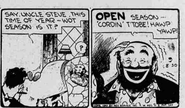
By V. T. Hamlin