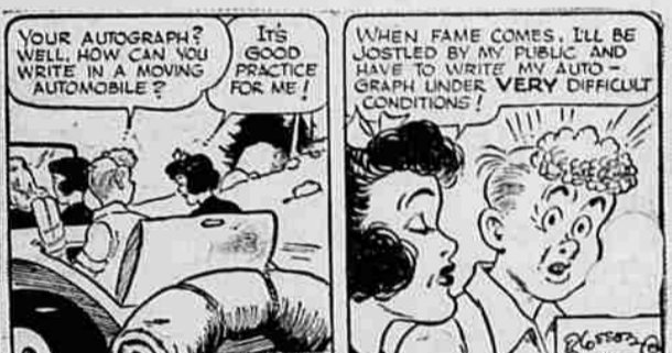
By Leslie Turner