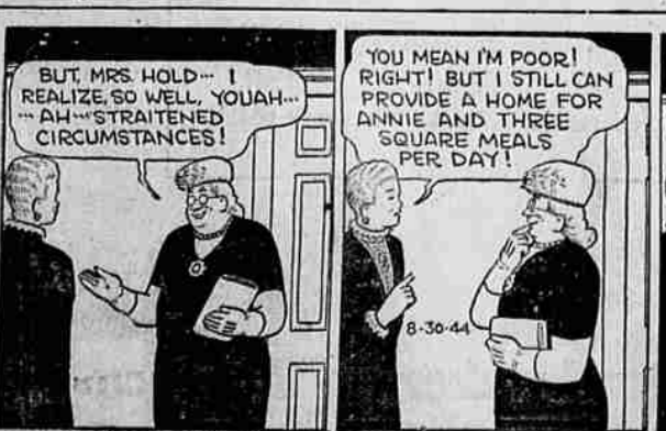
By Harold Gray