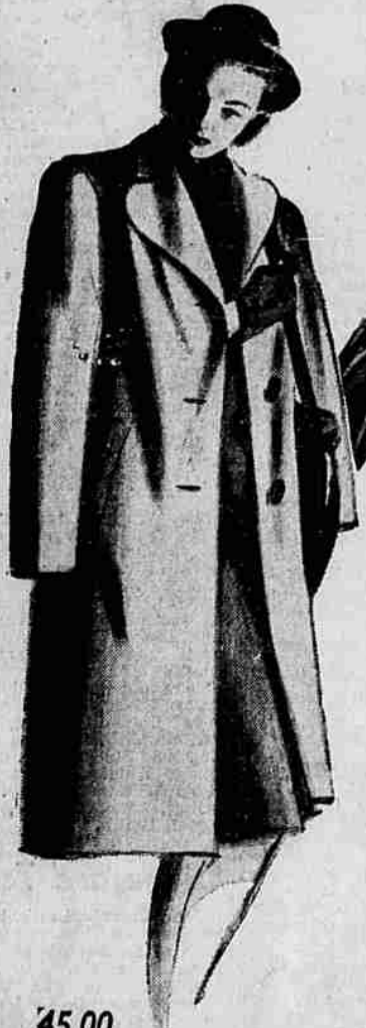
45.00 All time classic. Zarana cloth. Round lapels. Blue or gold. Sizes 10 to 20.

Rothmoor combines very smart styling and very rich fabrics in a manner you'll find both new and flattering. Definitely flattering!