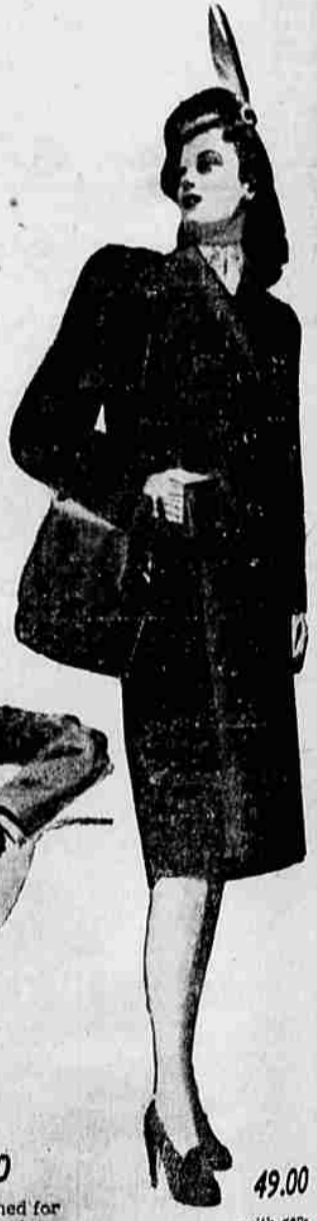
49.00 To wear with genuine pride... Juilliard needle point wool. Black, blue or brown. Sizes 18 to 44.