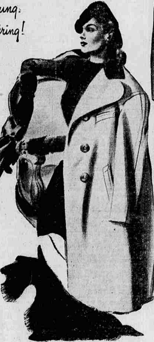
49.00 A wonderful, wonderful cloth coat for softness and warmth. Grey or black. Sizes 10 to 42.