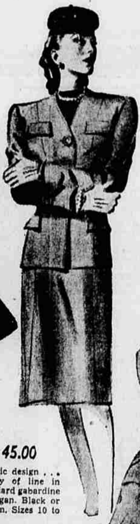
45.00 Classic design... purity of line in Juilliard gabardine cardigan. Black or brown. Sizes 10 to 20.