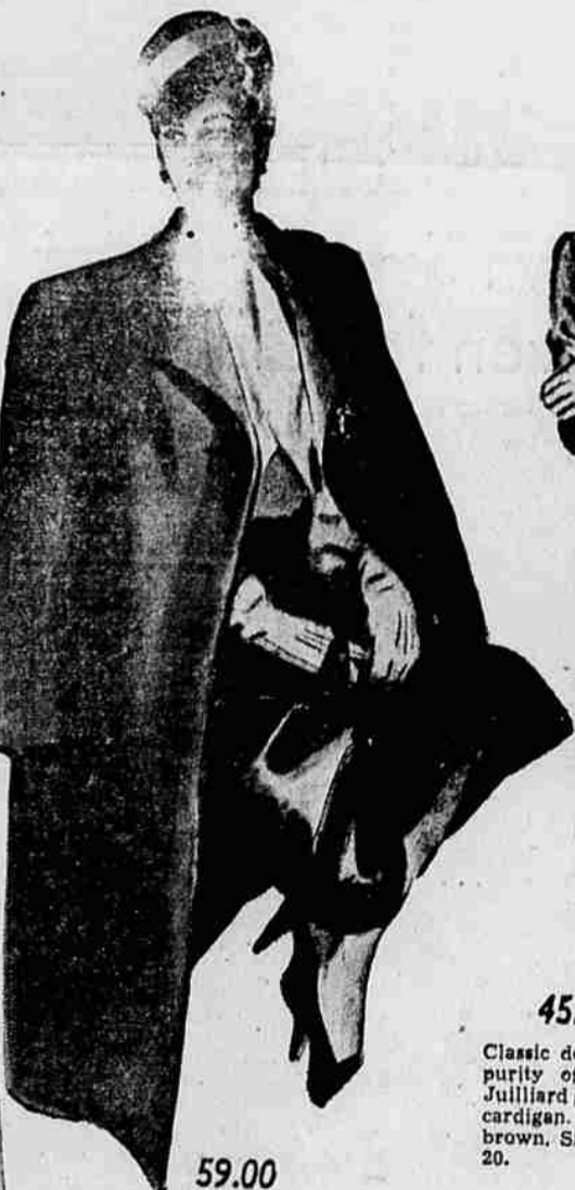
59.00 Unique needlepoint embroidery enhances Juilliard Melton cloth. Yarn-dye grey. Sizes 12 to 18.