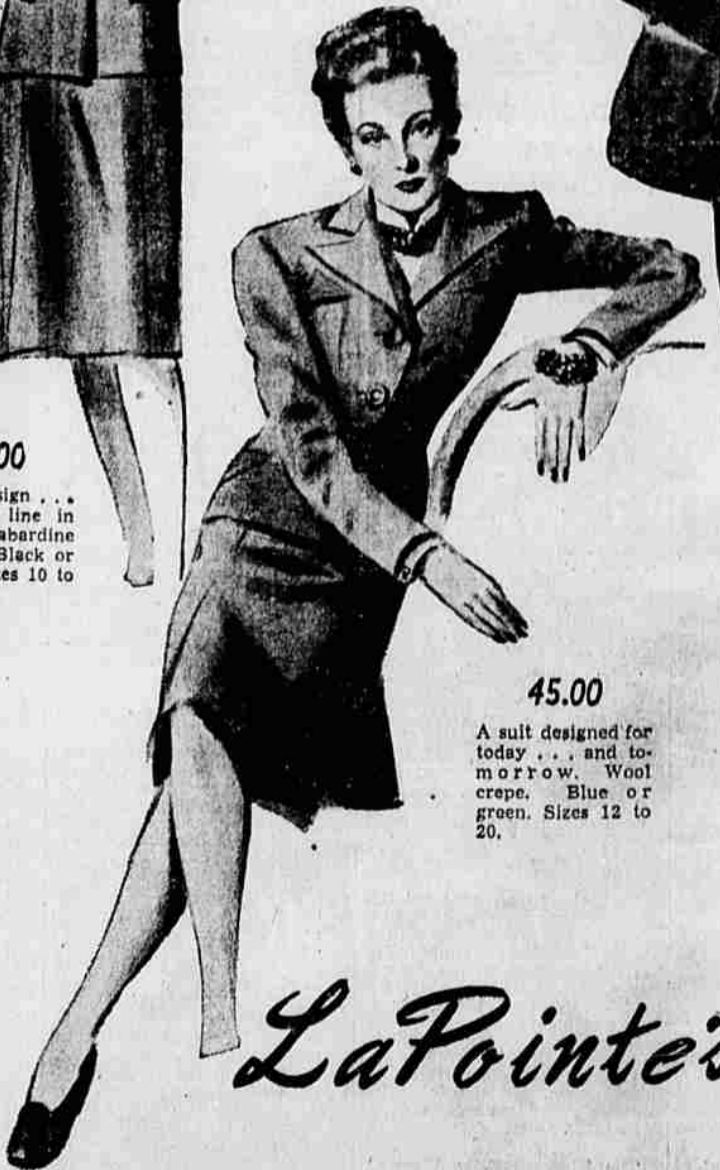
45.00 A suit designed for today... and tomorrow. Wool crepe. Blue or green. Sizes 12 to 20.