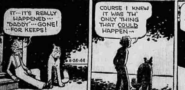
Little Orphan Annie By Harold Gray