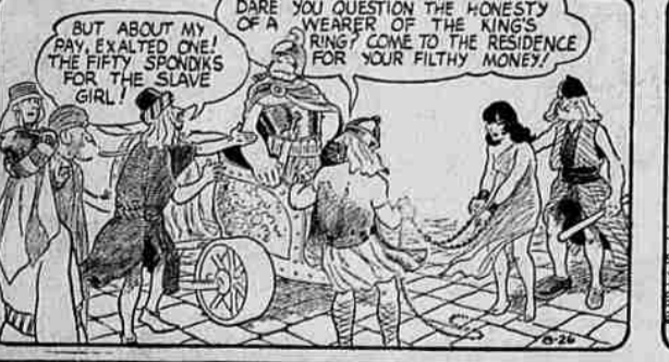
Little Orphan Annie By Harold Gray