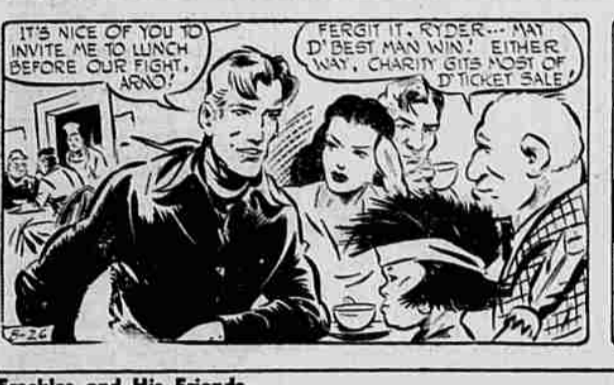
Freckles and His Friends By Blosser

10 Help Wanted, Male 18 Help Wanted, Male 30 Real Estate For Sale 30 Real Estate For Sale