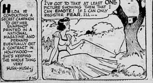
Wash Tubbs By Leslie Turner