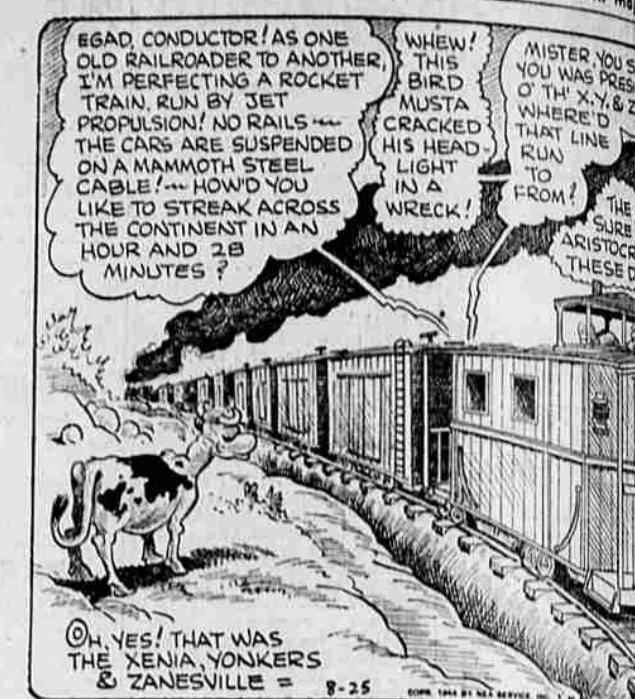
OH, YES! THAT WAS THE XENIA, YONKERS & ZANESVILLE 8-25