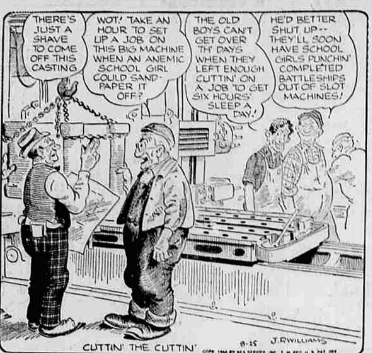
CUTTIN' THE CUTTIN' 8-25 J.R.WILLIAMS