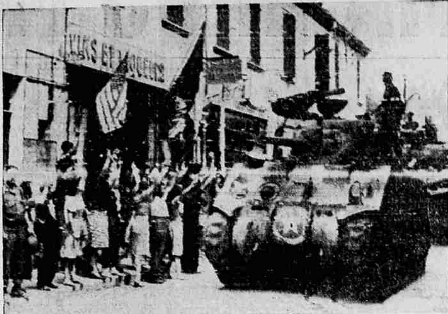
(NEA Radio-Telephoto) Cheering French civilians, holding up their hands in V sign and displaying French and American flags, greet American tankmen passing through their liberated southern France village toward Toulon, giant French naval base. Signal Corps radio-telephoto from Italy.