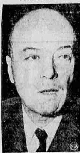
William C. Bullitt, 53, above, former U. S. ambassador to France, who was refused active duty twice because of his age by Secretary of War Stimson, has joined the French army as a commandant, equivalent to a major in the American Army.