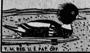
T.M. REG. U.S. PAT. OFF.

WAVES AT SEA ARE CHILDREN OF THE WIND! SOME ARE ONLY THE FAINTEST RIPPLES, WHILE OTHERS BREAK OVER THE DECKS OF SHIPS.