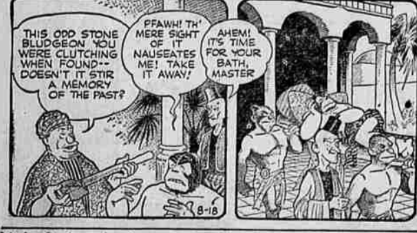
Little Orphan Annie