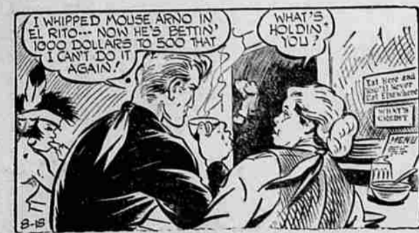
Freckles and His Friends