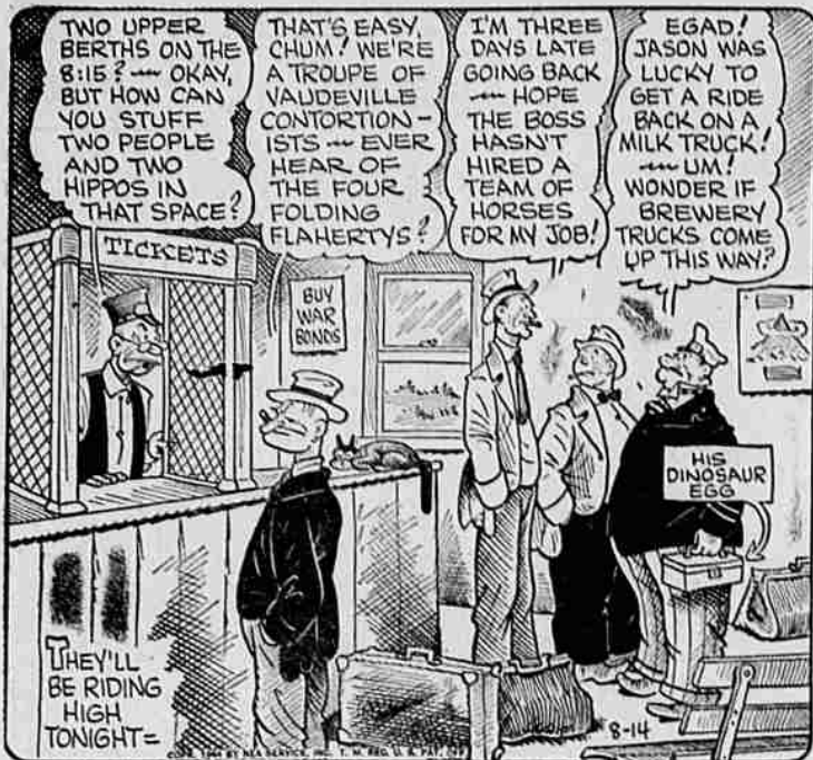
THEY'LL BE RIDING HIGH TONIGHT