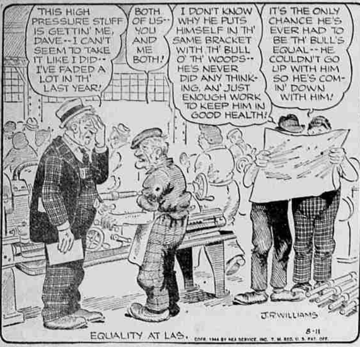
EQUALITY AT LAST... 8-11