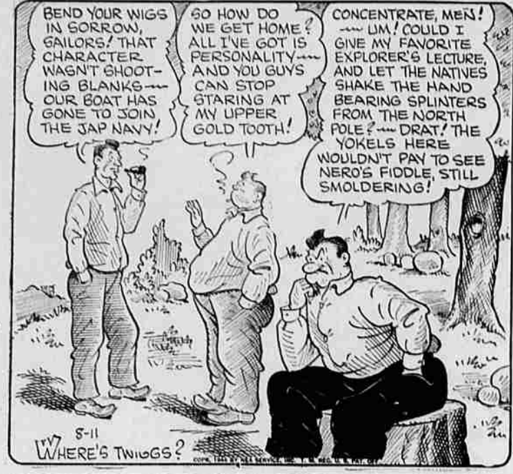
WHERE'S TWIGGS? 8-11