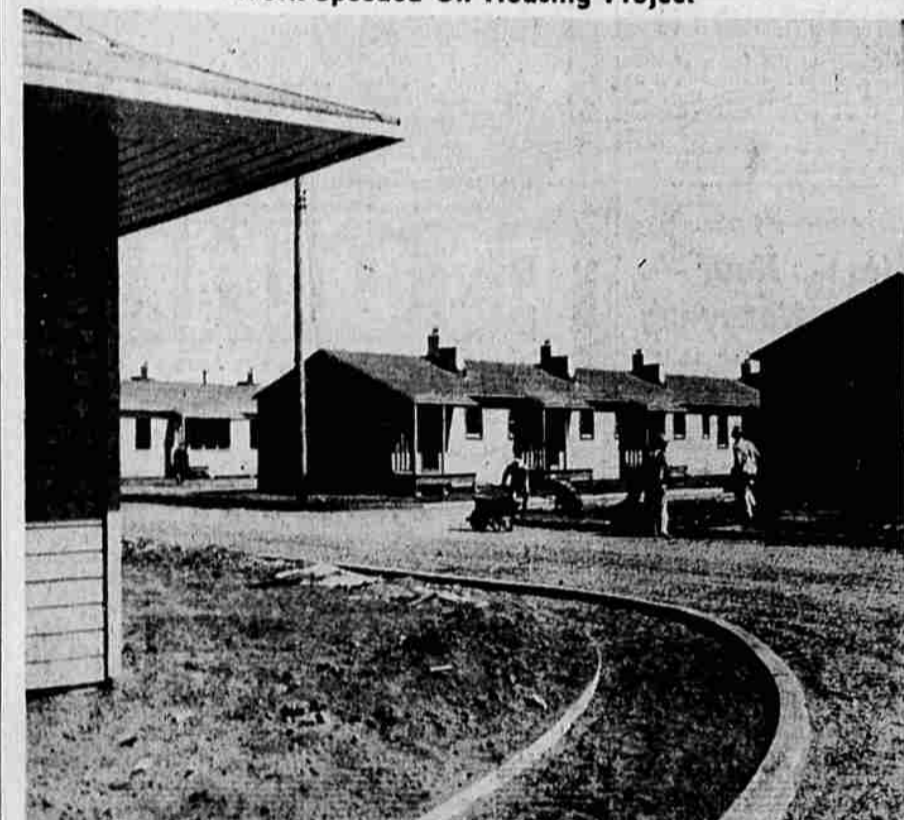
Recent progress on FPMA row houses is shown above, as workmen lay cement sidewalks in preparation for landscaping the grounds. Work is being speeded up to complete some of the apartments by the latter part of this month.