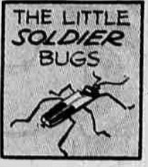
THE LITTLE SOLDIER BUGS