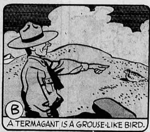
(B) A TERMAGANT IS A GROUSE-LIKE BIRD.