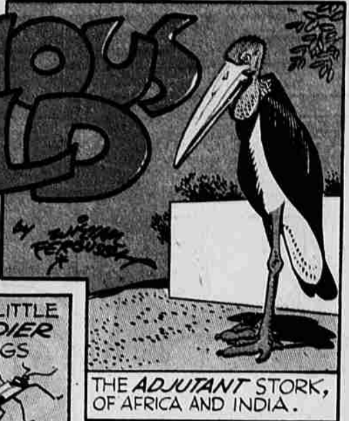
THE ADJUTANT STORK, OF AFRICA AND INDIA.

EVEN OUR NATURE BOOKS REMIND US OF WAR... FOR INSTANCE — T.M. REG. U.S. PAT. OFF.