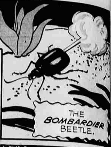
THE BOMBARDIER BEETLE.