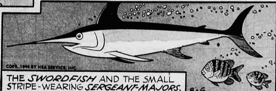
THE SWORDFISH AND THE SMALL STRIPE-WEARING SERGEANT-MAJORS.