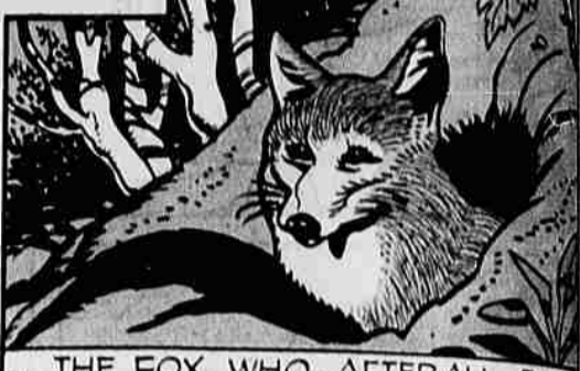
... THE FOX, WHO, AFTER ALL, DUG THE VERY FIRST OF ALL FOX HOLES.