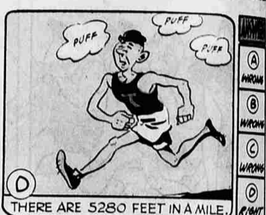
(D) THERE ARE 5280 FEET IN A MILE.