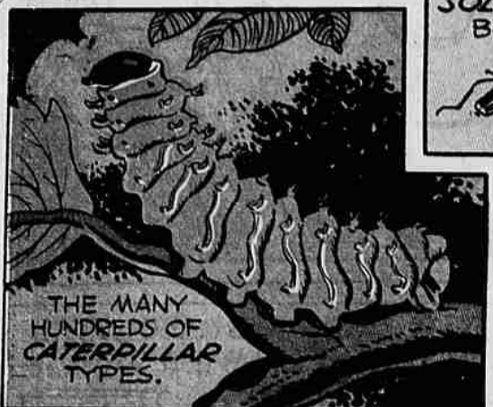
THE MANY HUNDREDS OF CATERPILLAR TYPES.