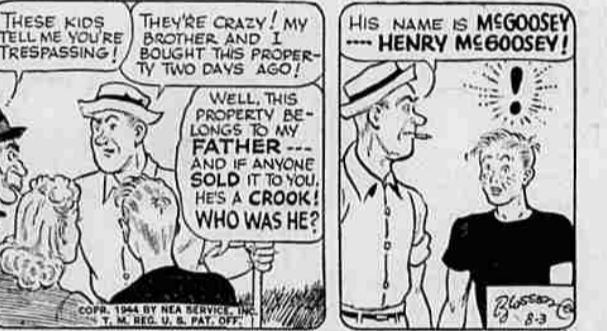
By Leslie Turner