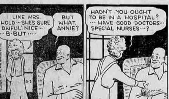
Little Orphan Annie