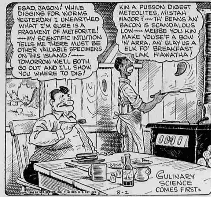
CULINARY SCIENCE COMES FIRST