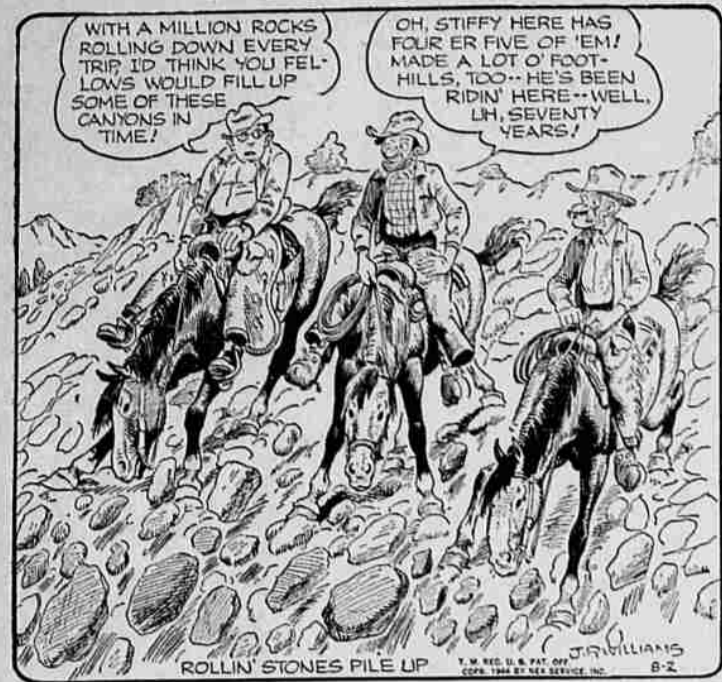
ROLLIN' STONES FILE UP