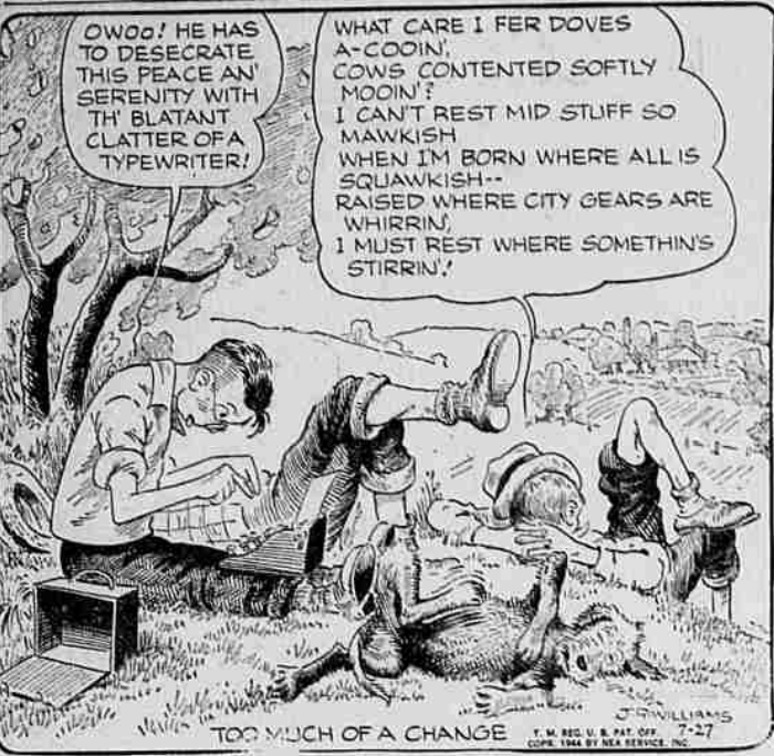
TOO MUCH OF A CHANGE