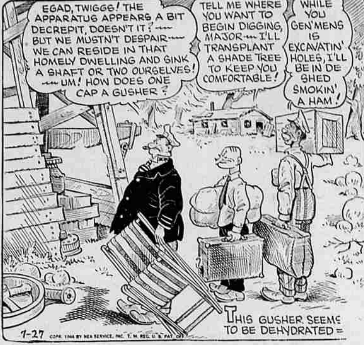
THIS GUSHER SEEMS TO BE DEHYDRATED