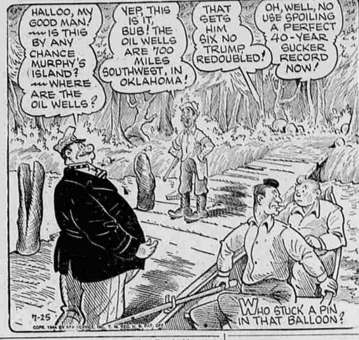
HEROES ARE MADE--NOT BORN

HALLOO, MY GOOD MAN! IS THIS BY ANY CHANCE MURPHY'S ISLAND? WHERE ARE THE OIL WELLS? YEP, THIS IS IT, BUB! THE OIL WELLS ARE 700 MILES SOUTHWEST, IN OKLAHOMA! THAT GETS HIM SIX NO TRUMP REDOUBLED! OH, WELL, NO USE SPOILING A PERFECT 40-YEAR SUCKER RECORD NOW!